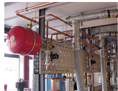
OSZ VT heating engineering laboratory and practice wall installation