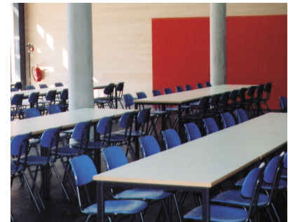
Network OSZ WSV cafeteria